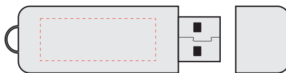
Back Print Area : 30mm x 11mm Laser Engrave