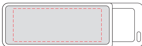
Front Print : 40 x 15 mm 4CP Direct Digital Print Pad Print Laser Engrave

Colours: Product Colour: Black, Blue, Red, White