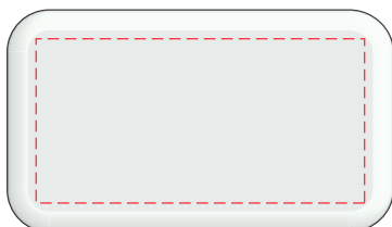
Epoxy Doming Sticker size: 46.5 x 26.5 mm