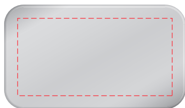
Aluminium Plate Size: 46.5 x 26.5 mm

Colours: Product Colour: Black (stock), Customised colour available MOQ-500 pcs (Delivery 45 days)